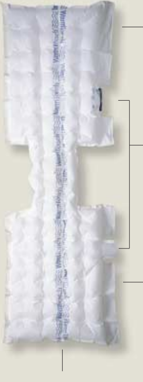
X-ray transparent materials won't affect or interfere with X-rays.